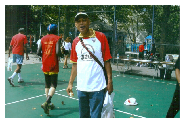
Otis before a recent race